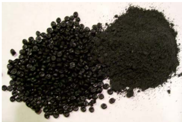
Cryogenic grinding reduces polymer samples to a fine powder that provides a large surface area for the solvent to attack. Additives in samples ground this way are extracted more efficiently with more consistent results.

Step 2 – Grind the polymer cryogenically and sieve to form a fine powder. This is a critical step because one concern in developing the method was the completeness of the extraction. Additives such as flame retardants are used at such low levels that efficient extraction is often a problem. To minimize this issue, the sample is ground under cryogenic conditions and sieved through fine mesh filters to produce an extremely small particle size.